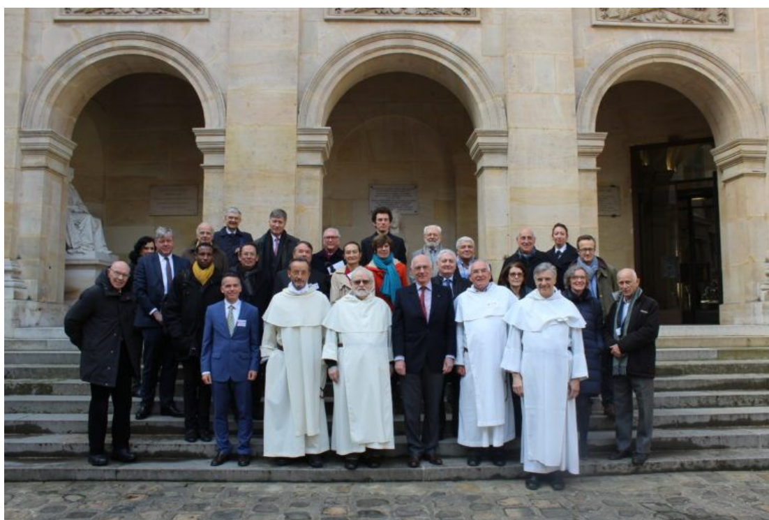
A “classroom photograph” of the day with participants and presents