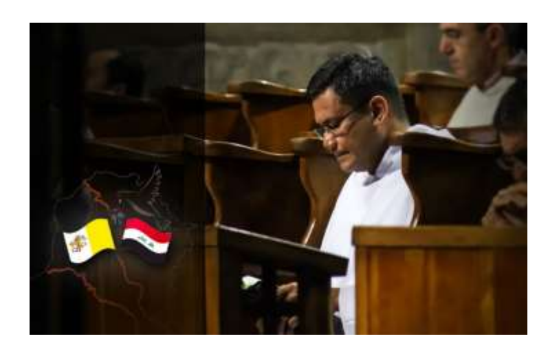
Prot. 50/21/094 MO Message Iraq

MO'S & Socius' letter to the Dominican Family in Iraq on the occasion of the papal visit 2021