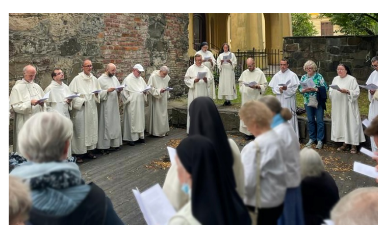
8 Dominican Family celebrated Jubilee in Oslo.

On 6 August, the Dominican Family celebrated not only our father St Dominic, but also the jubilee of one hundred years of the presence of the friars preachers here!