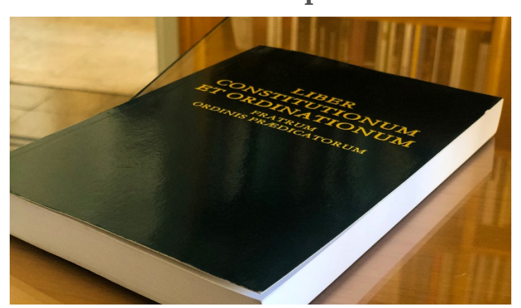
3 Book of Constitutions and Ordinations of the Friars of the Order of Preachers

The 2021 edition of the Constitutions of the Dominican Friars has been published.